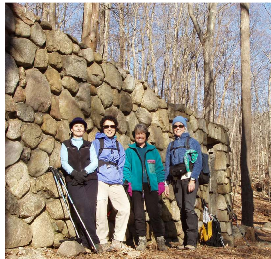
Group Standing in front of ruins of stone cabin