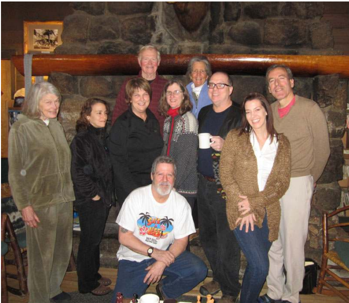
Martin Luther King weekend at the Adirondack Loj in Lake Placid, NY